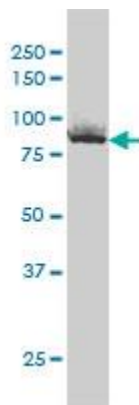
XRCC5 Monoclonal Antibody, clone 3D8. Western Blot analysis of XRCC5 expression in A-431.