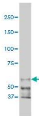
PAK1 Monoclonal Antibody, clone 4D1. Western Blot analysis of PAK1 expression in HeLa NE.