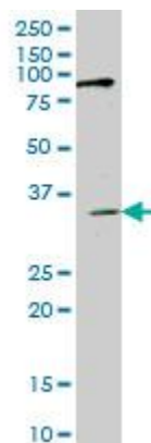
IBRDC1 Monoclonal Antibody, clone 4B1. Western Blot analysis of IBRDC1 expression in HepG2.