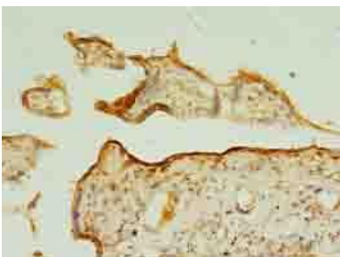
Immunohistochemistry of paraffin-embedded human placenta tissue using TSPAN31 Polyclonal Antibody at dilution of 1:100

ELISA, IHC, IF; Recommended dilution: IHC:1:20-1:200, IF:1:50-1:200